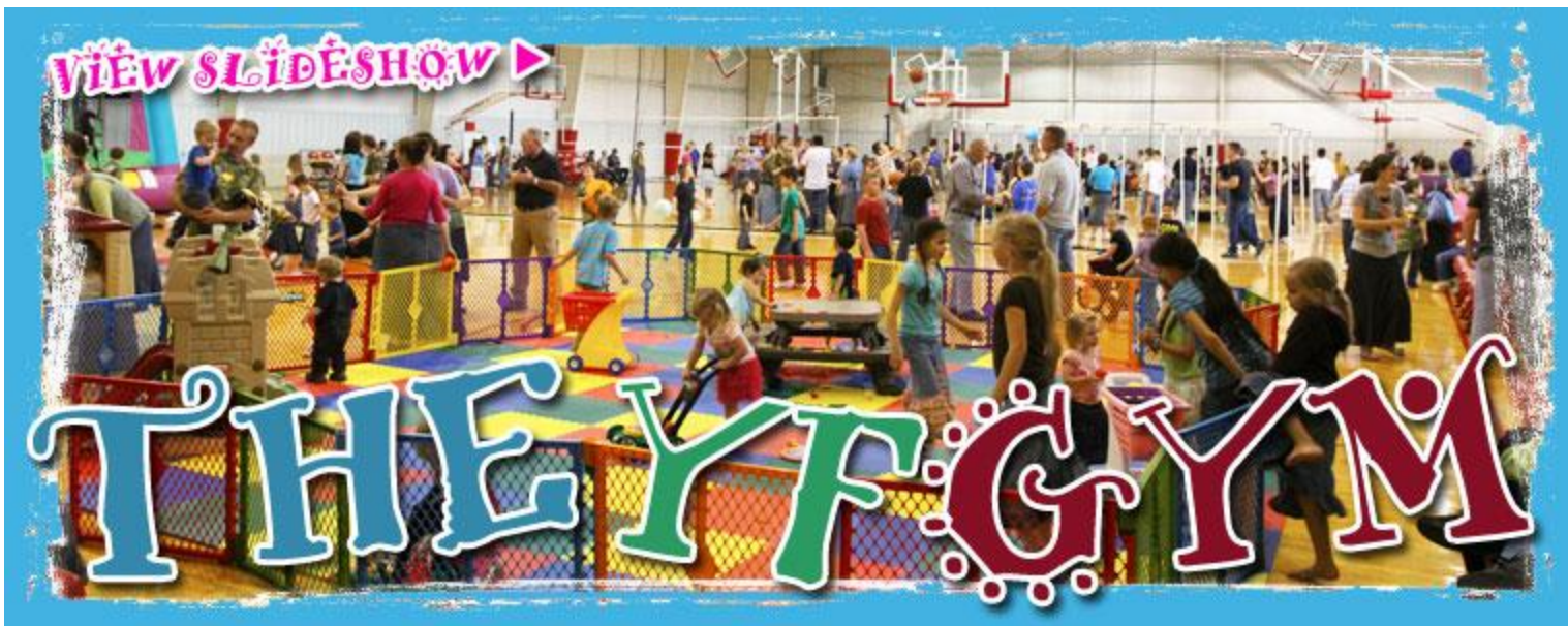
The Young Foundation (YF) Gym Monday, March 26, 2012

"Young Foundations is a ministry of Voice Of God Recordings: